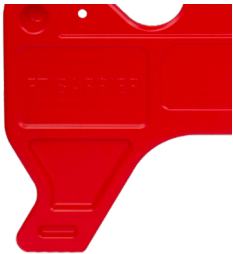
Label recess areas