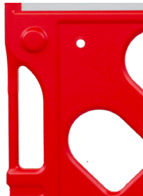
Square hinge locking feature